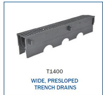
T1400 WIDE, PRESLOPED TRENCH DRAINS

ROOF TOP PIPE SUPPORTS UV resistant and made with recycled rubber.