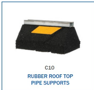
C10 RUBBER ROOF TOP PIPE SUPPORTS

MI-GARD FLOOR DRAIN TRAP SEAL Prevents odors and sewer gases from coming through drains.