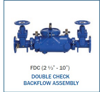
FDC (2 1/2" - 10") DOUBLE CHECK BACKFLOW ASSEMBLY

FINISHED FLOOR DRAINS Durable finished floor drains with optional membrane.