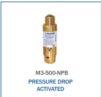
M3-500-NPB PRESSURE DROP ACTIVATED

TRENCH DRAINS Plastic, stainless steel trench drain systems.