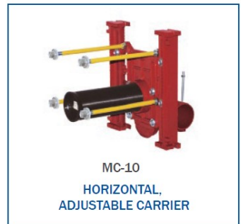
MC-10 HORIZONTAL, ADJUSTABLE CARRIER

ACCESS DOORS Available in both satin coated steel and stainless steel.