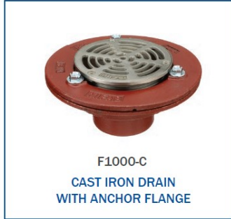
F1000-C CAST IRON DRAIN WITH ANCHOR FLANGE

HDPE INTERCEPTORS Grease, oil, solids/sediment interceptors. 10-250 GPM sizes.