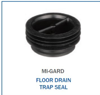
MI-GARD FLOOR DRAIN TRAP SEAL

BEECO - BACKFLOW VALVES Backflows, PRVs, strainers and gauges.