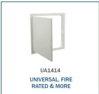
UA1414 UNIVERSAL, FIRE RATED & MORE

TRAP SEAL PRIMERS Pressure drop activated, electronic and more.