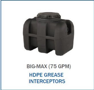
BIG-MAX (75 GPM) HDPE GREASE INTERCEPTORS

HYDRANTS INTERCEPTORS TRAP SEAL PRIMERS WATER HAMMER ARRESTORS